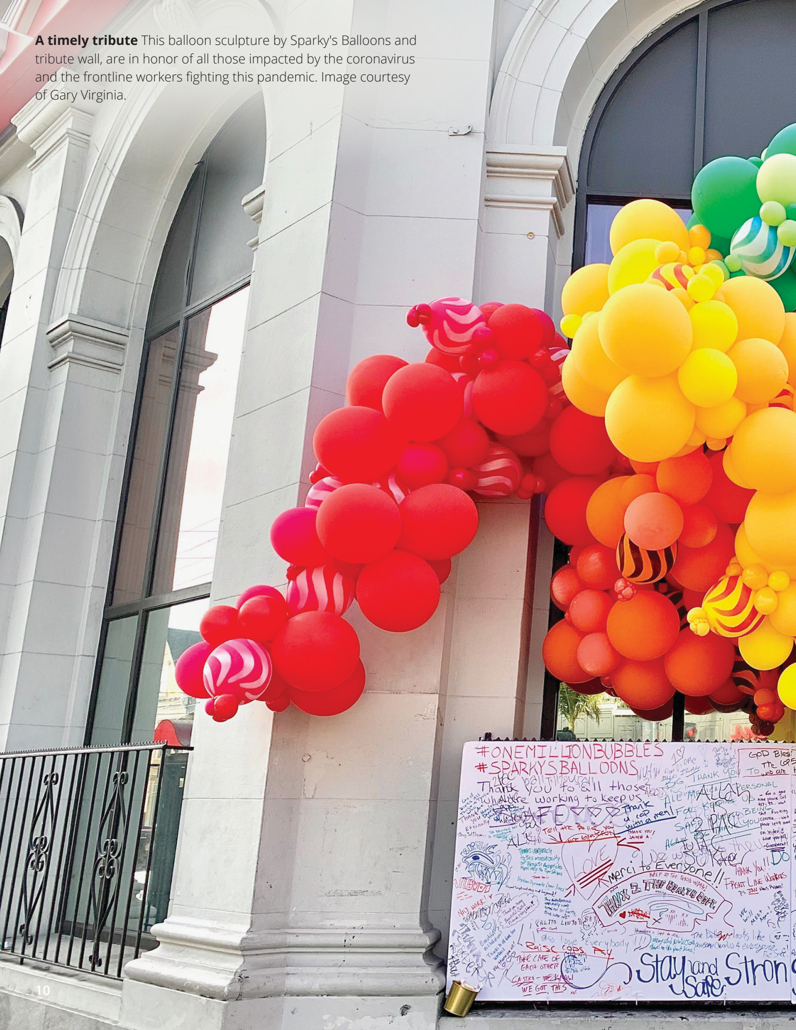
A timely tribute This balloon sculpture by Sparky's Balloons and tribute wall, are in honor of all those impacted by the coronavirus and the frontline workers fighting this pandemic.