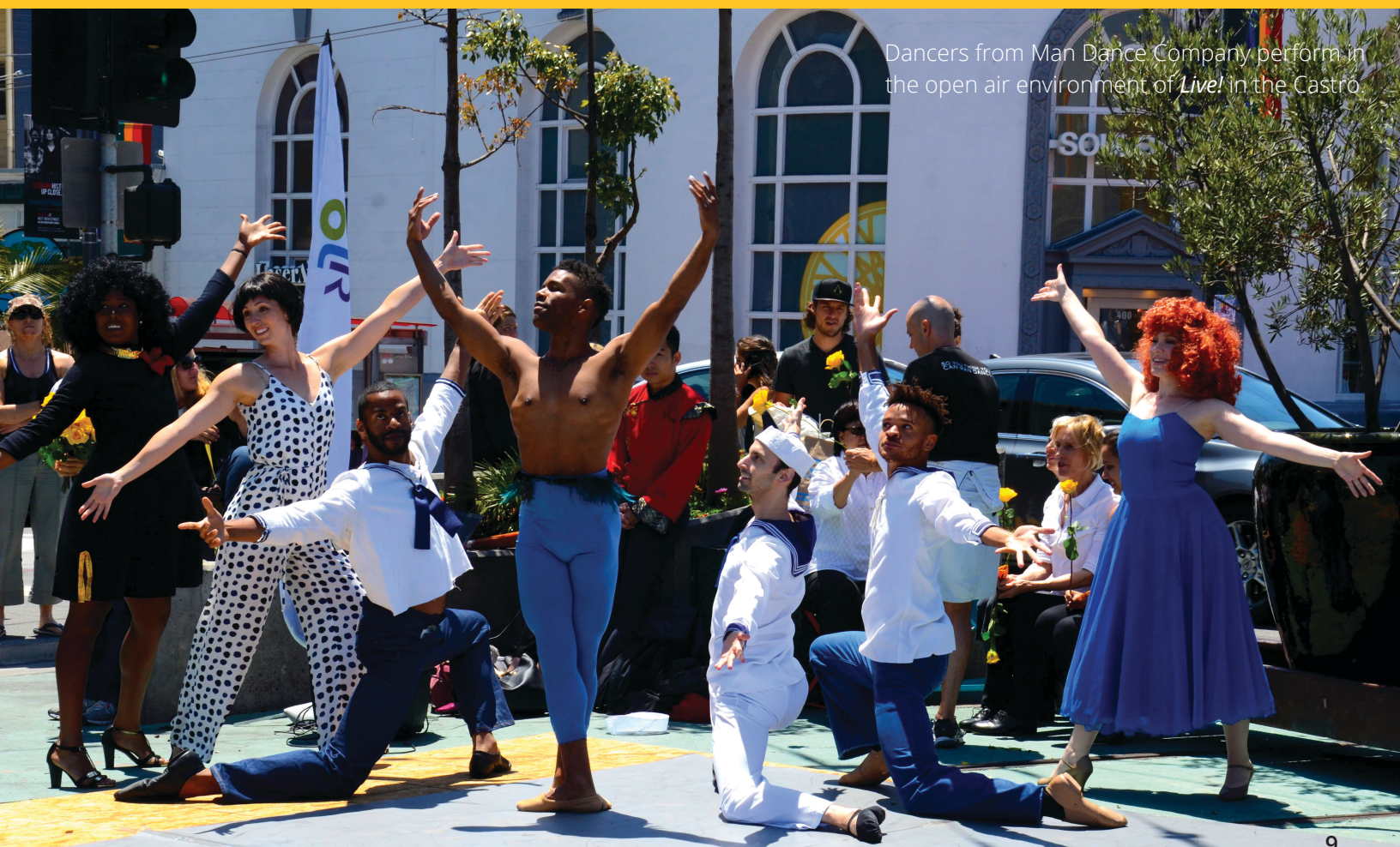
Dancers from Man Dance Company perform in the open air environment of Live! In the Castro