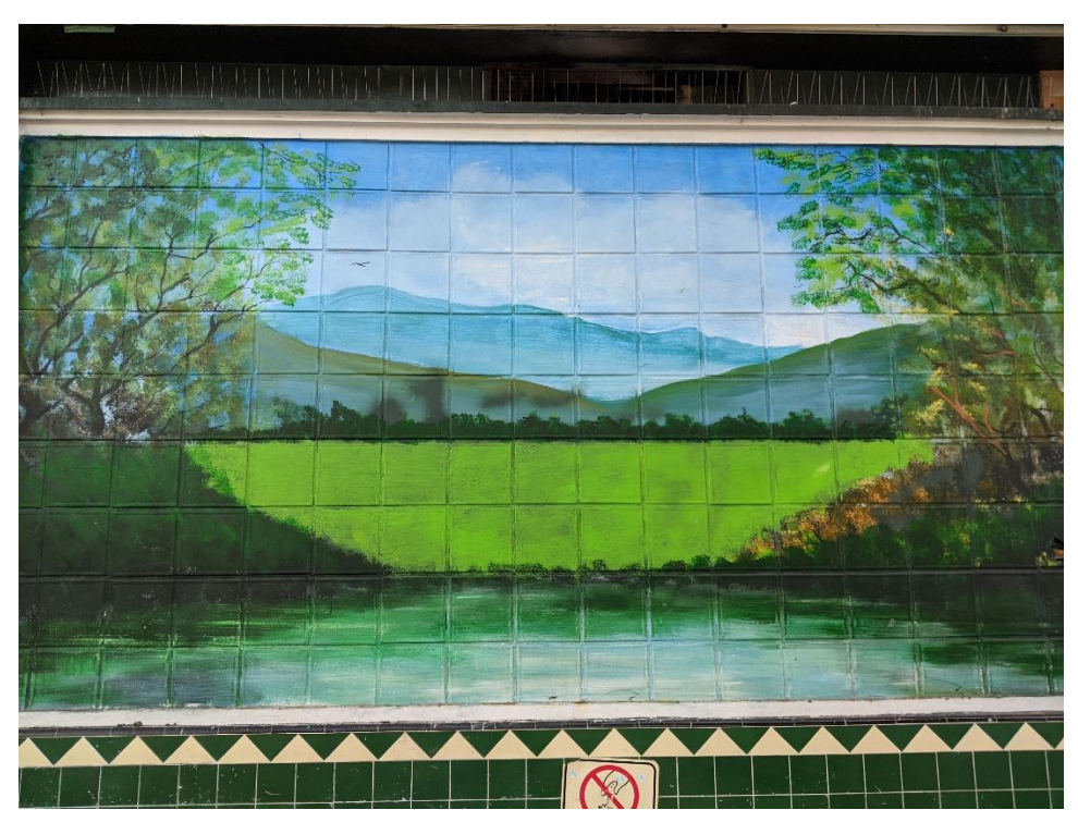
Glass block and ceramic tile infill storefront at 4773 Mission Street, January 2020.