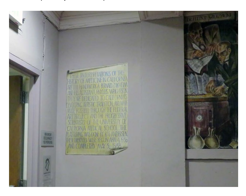
Fresco 1 (Dedication scroll)