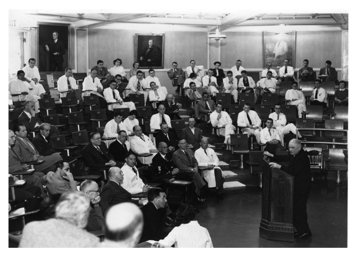
Toland Hall, view of curved south wall with frescoes covered, 1953.