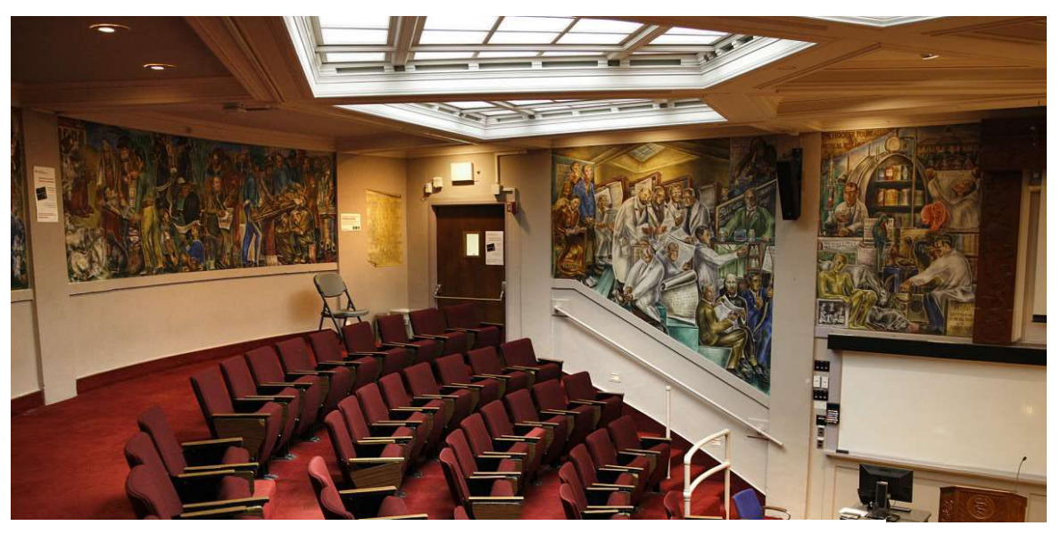
Toland Hall, view northwest, 2015.