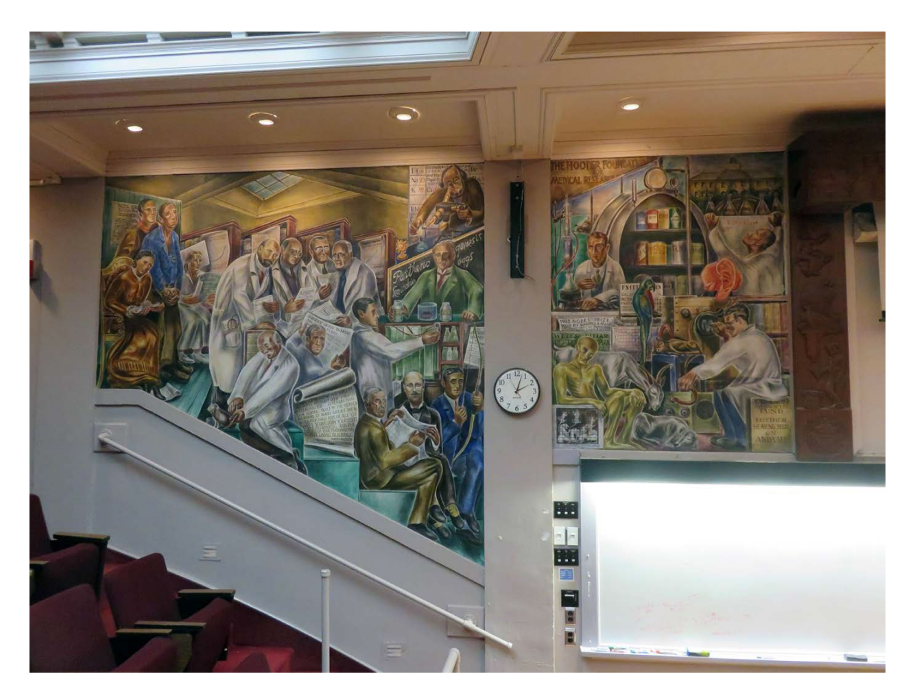
Fresco 9 Fresco 10