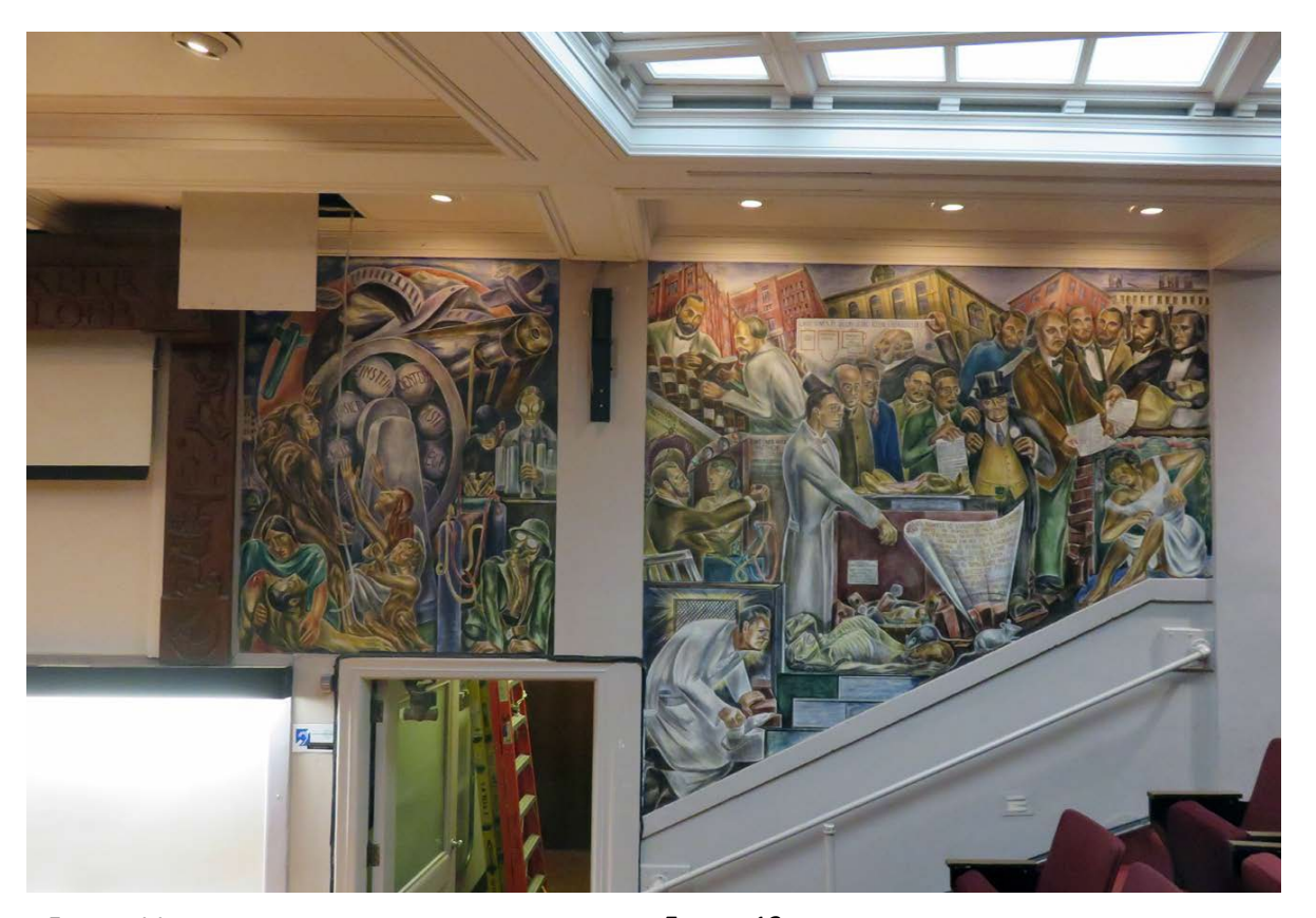
Fresco 11 Fresco 12