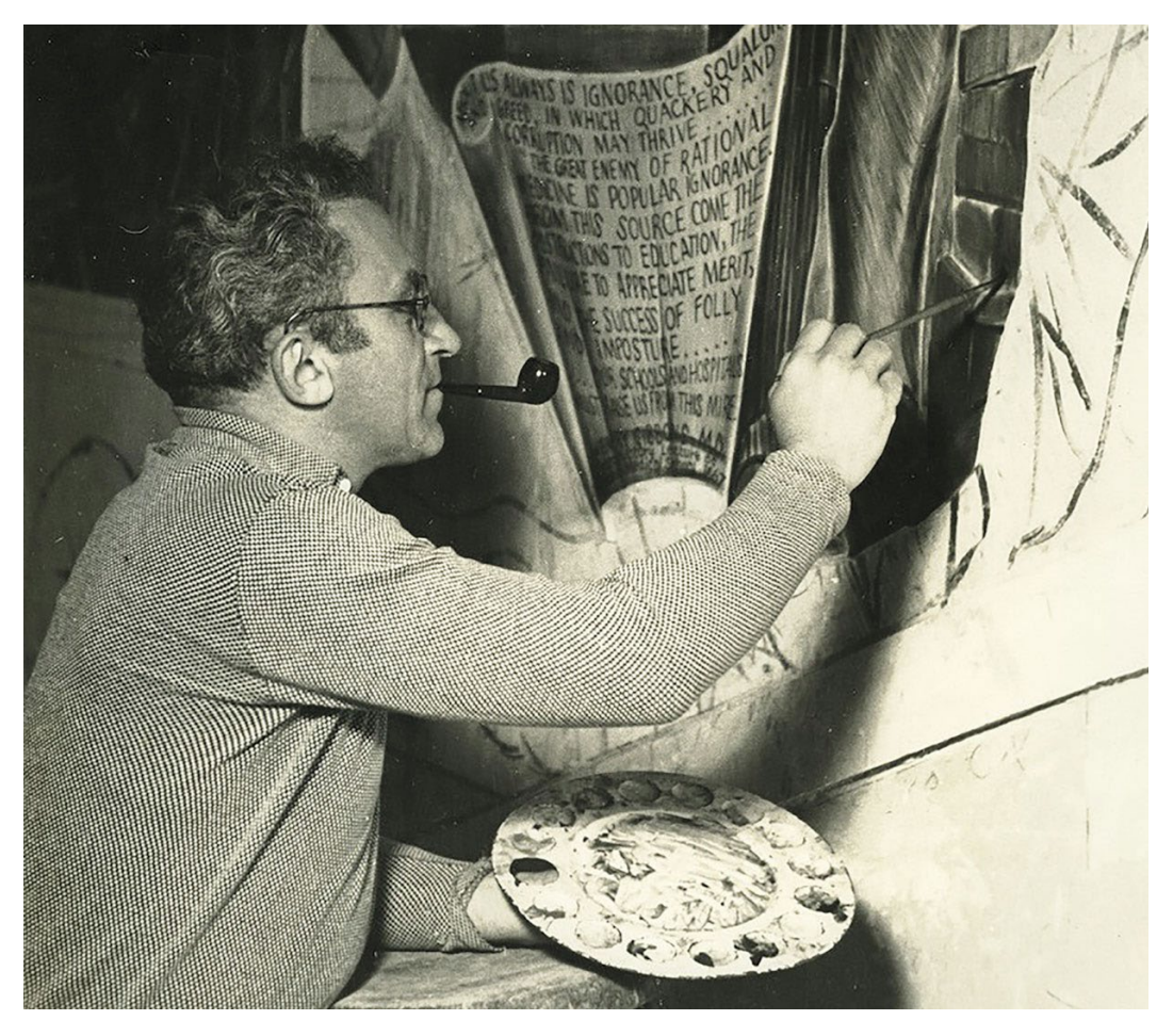
Bernard Zakheim painting "History of Medicine in California" fresco, 1937.