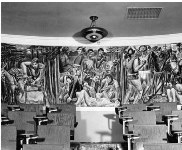
1939 Photographs of Toland Hall From Page & Turnbull, 2005. UC Hospital, 533 Parnassus Avenue, University of California, San Francisco Parnassus Heights Campus San Francisco, California, Historic American Building Survey Documentation, November, 49-50.