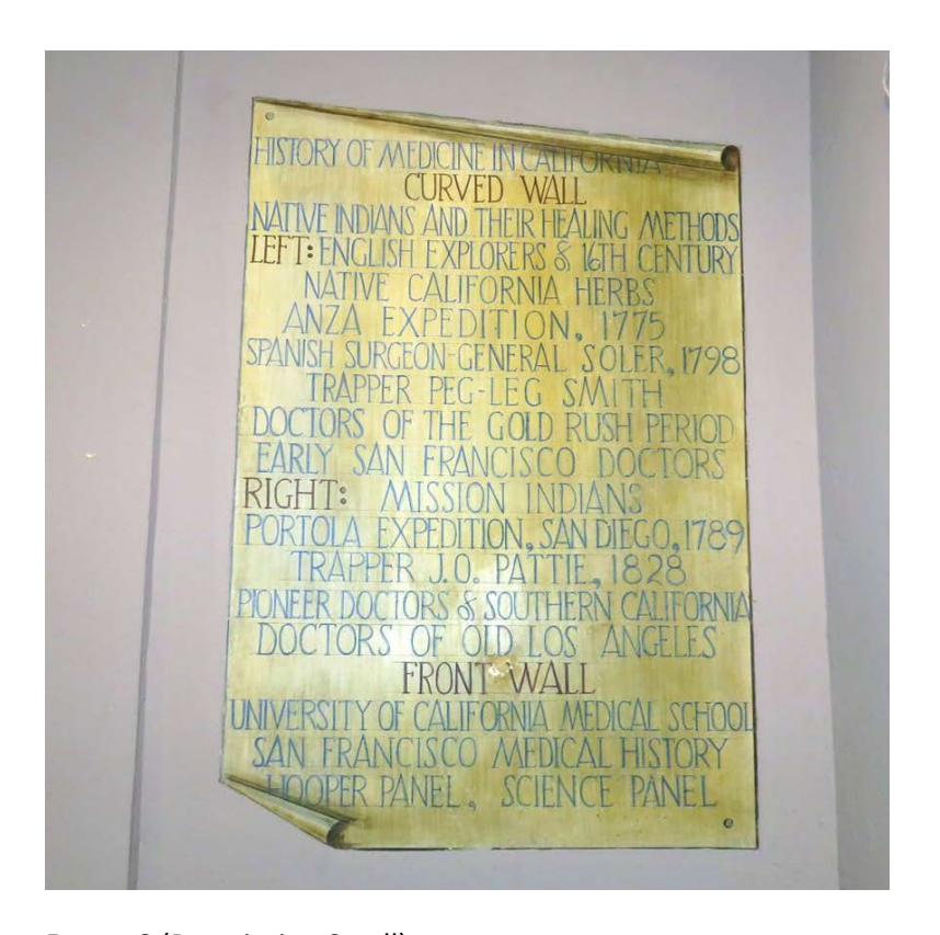
Fresco 8 (Description Scroll)