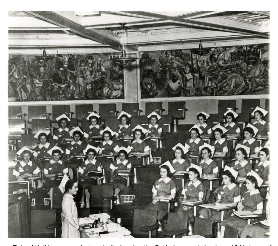
Toland Hall in use as a lecture hall, showing the Zakheim murals in place, 1941.