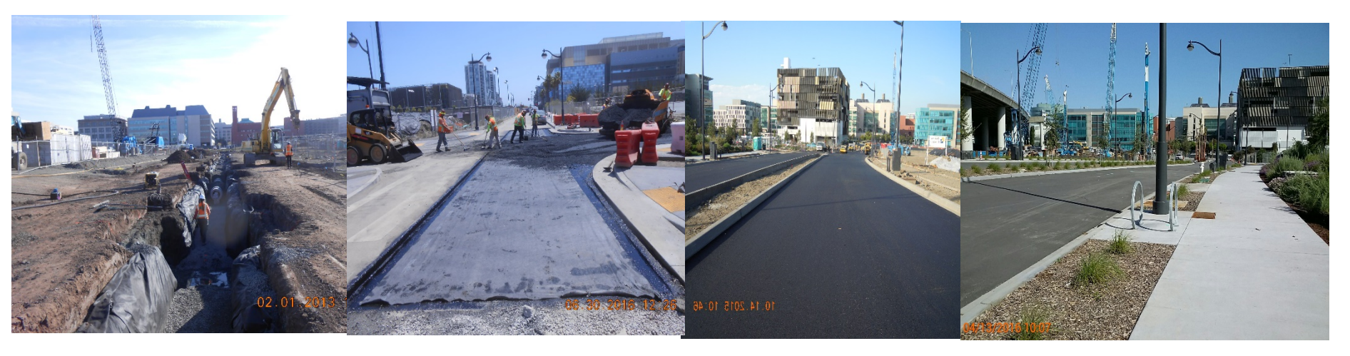
Utility pipe installation and active street paving through final landscape