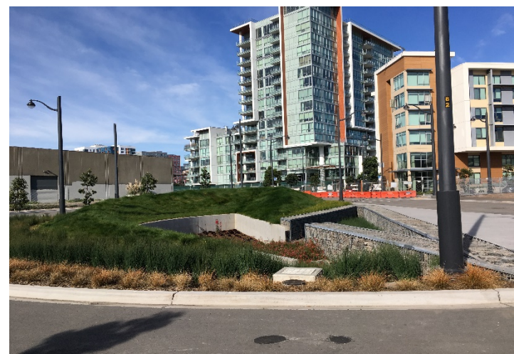
Bioswale Park P11A