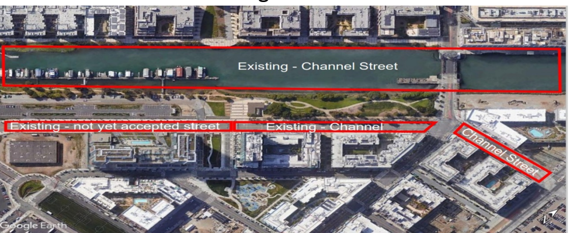
Proposed – Rename Mission Creek and Chanel Street