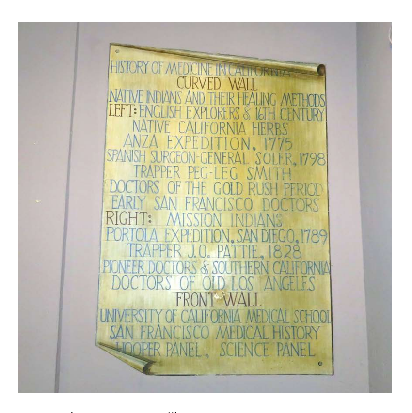
Fresco 8 (Description Scroll)