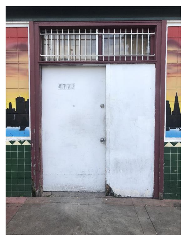
Original storefront entrance opening with replacement door and surround, 4773 Mission Street, January 2020.