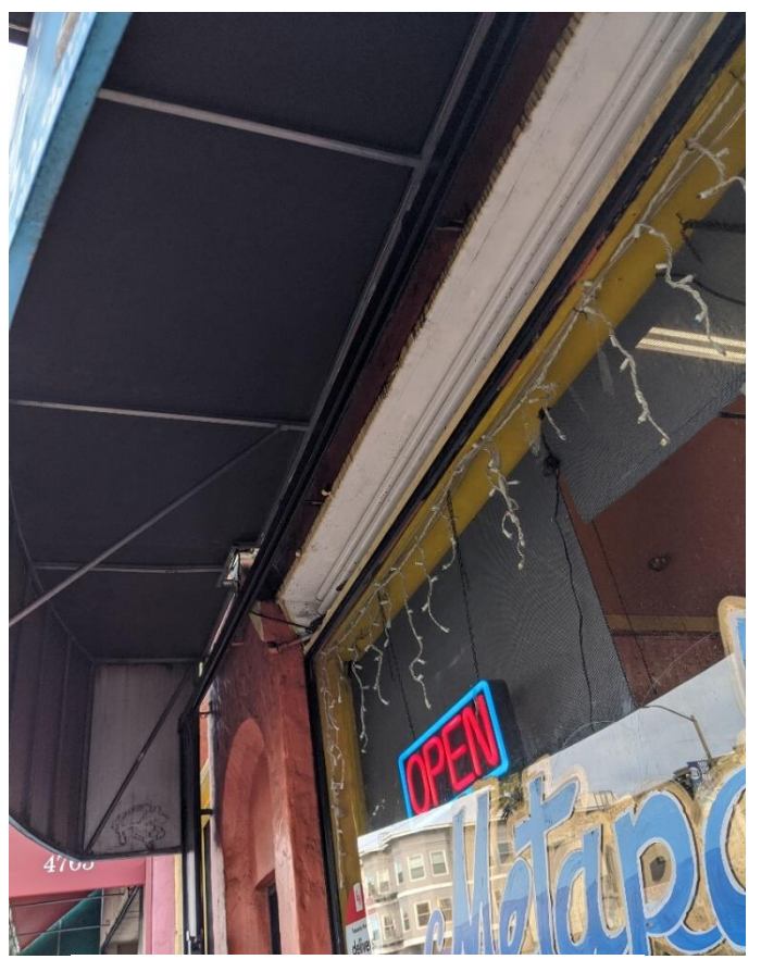
Transom detail, Pupuseria Metapan, 4769 Mission Street, January 2020.