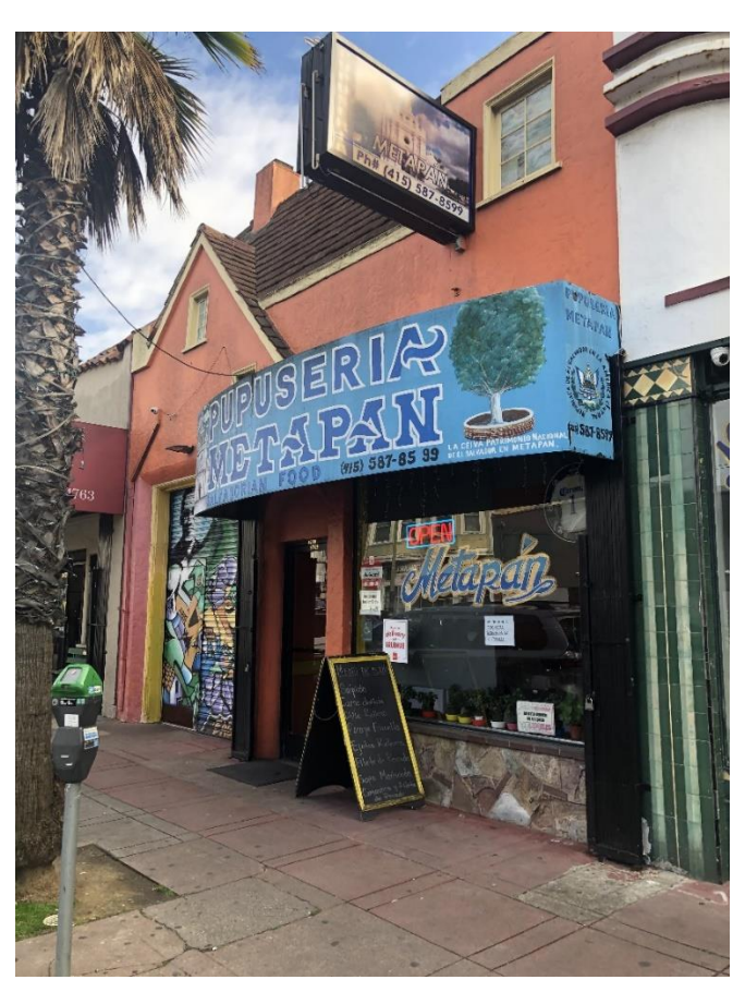
Pupuseria Metapan, 4769 Mission Street, January 2020.