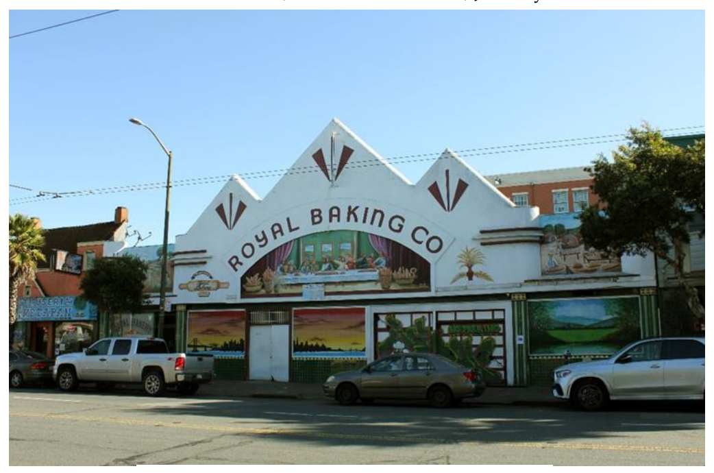
4773 Mission Street façade, January 2020.