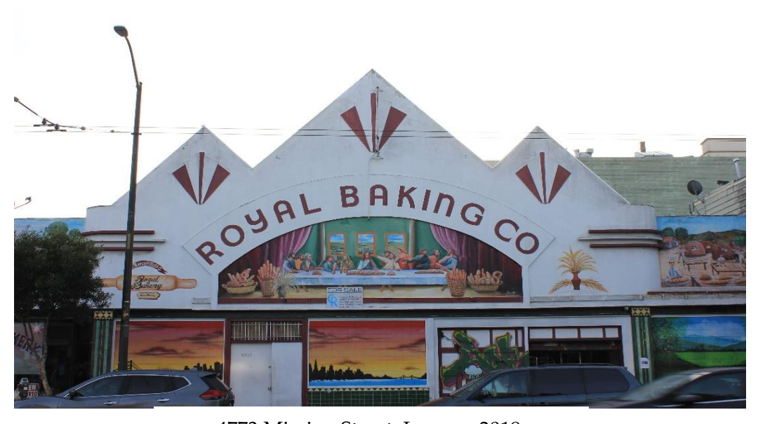
4773 Mission Street, January 2019.