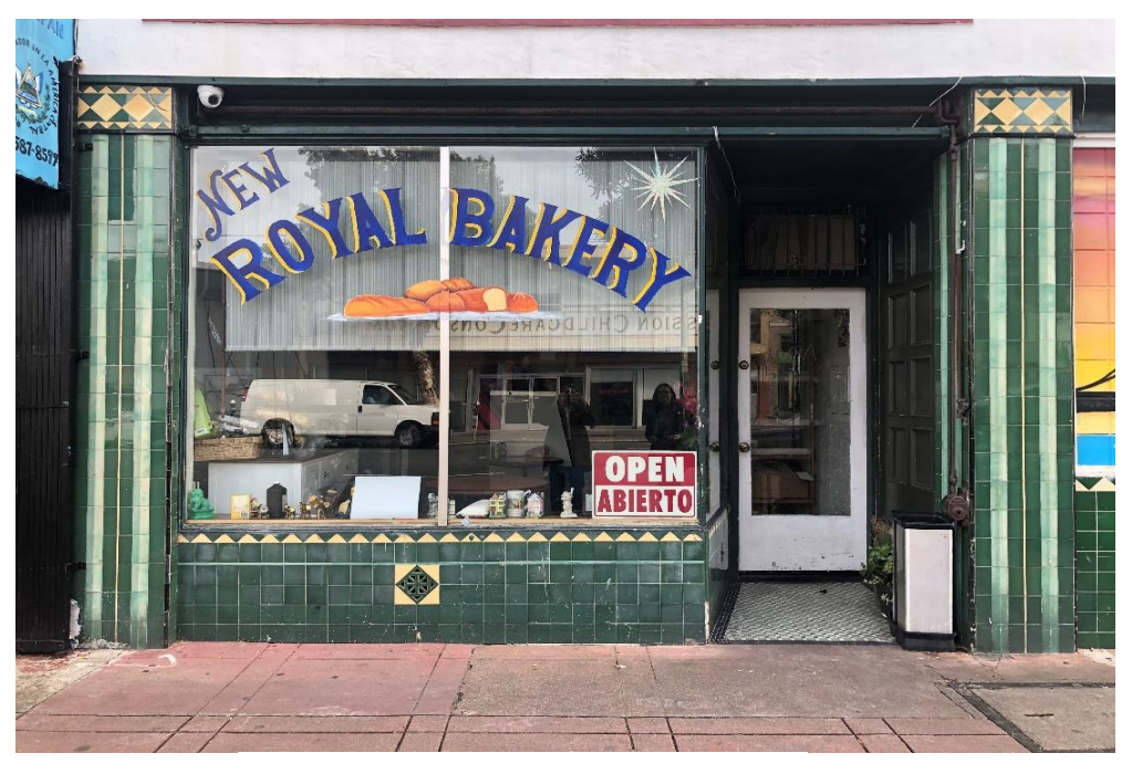
New Royal Bakery storefront, 4773 Mission Street, January 2020.