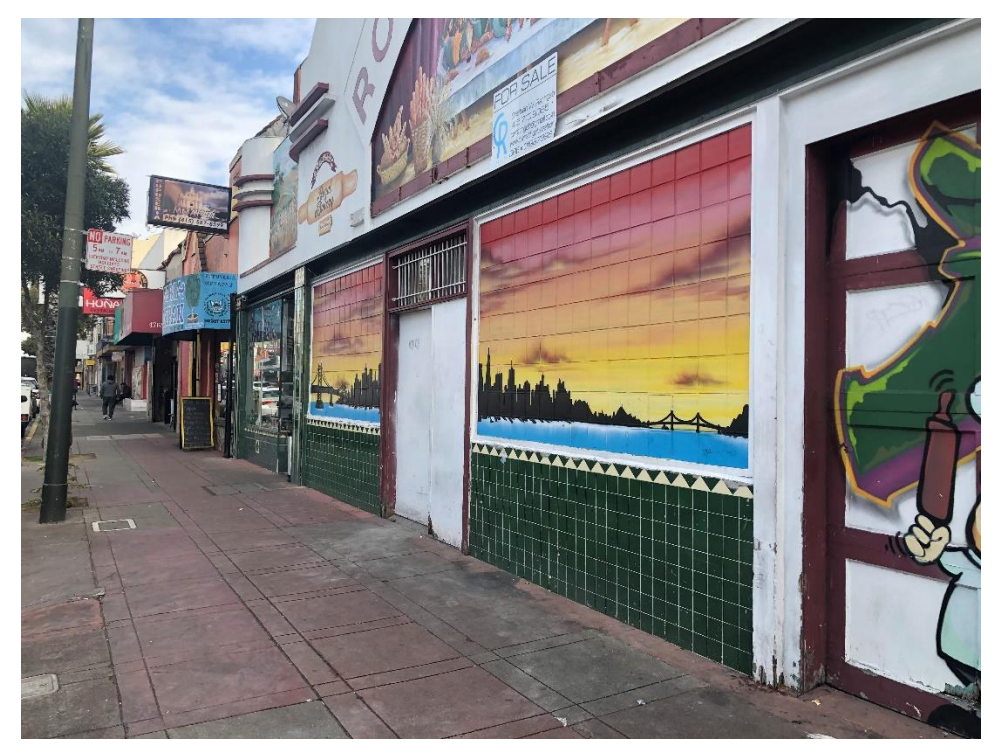
Storefront infill at 4773 Mission Street, January 2020.