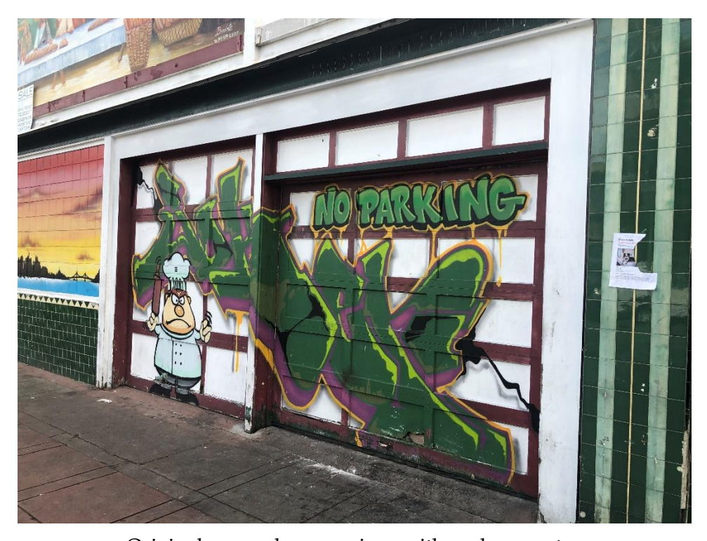
Original garage bay openings with replacement garage doors at 4773 Mission Street, January 2020.