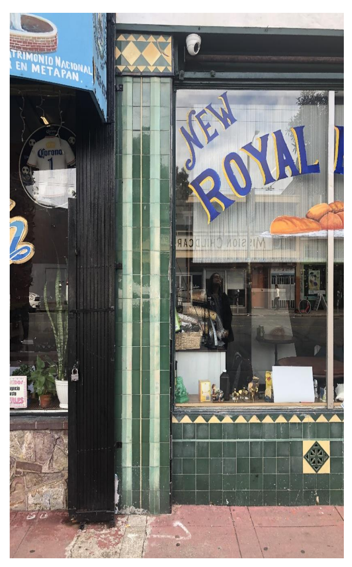
Original ceramic tile pier, bulkhead, and storefront glazing at 4773 Mission Street, January 2020.