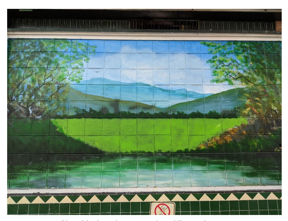
Glass block and ceramic tile infill storefront at 4773 Mission Street, January 2020.