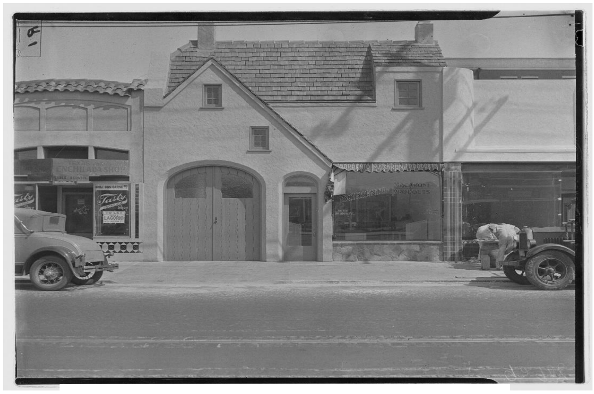
Sorrento Macaroni storefront at 4767 Mission Street.