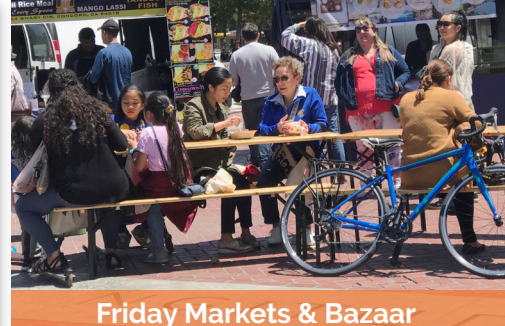
The Heart of the City Farmers' Market has expanded its hours in UN Plaza to Fridays, 7am to 4pm. (Their first Friday market since the 1980s!) The Market is joined by over 15 local artisan vendors from the Gift Gallery, SF Etsy and Square. The expanded Friday Farmers Market & Bazaar, which started June 7, also features food trucks from Off The Grid Markets and stalls, a rotation of free DIY activities at noon, lawn games and picnic tables for dining and hanging out with friends, family and co-workers. It's a great way to

Bi-Rite offers the menu staples of salads, sandwiches and bowls; and has exclusively brought their famed soft serve ice cream to the Civic Center Plaza location. Beer and wine will be available soon. Contact Bi-Rite for catering or to reserve the cafe for private events.