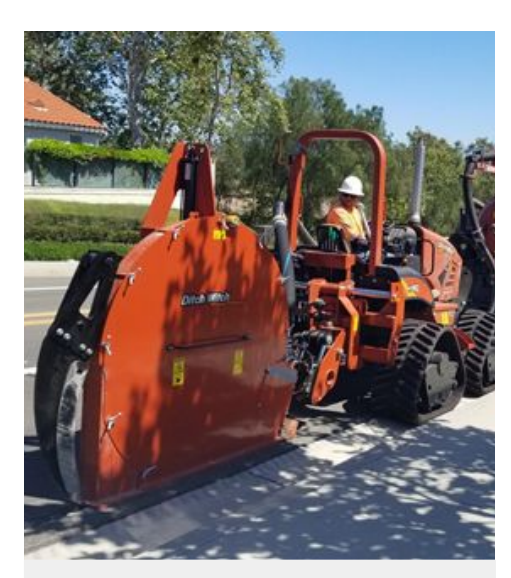
Faster, lower impact method. 16"-24" depth trench cut, 8-9" offset from concrete gutter.