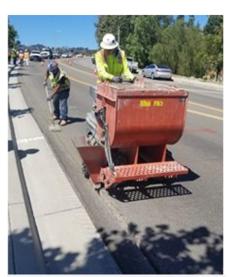
Reduces traffic disruption, no steel plates, lower cost restoration