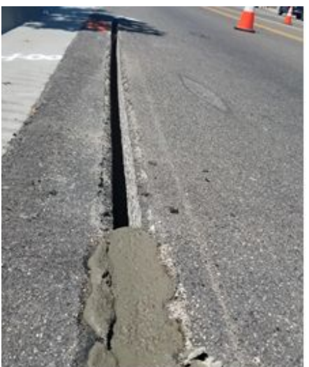
Cement slurry backfill is driveable same day