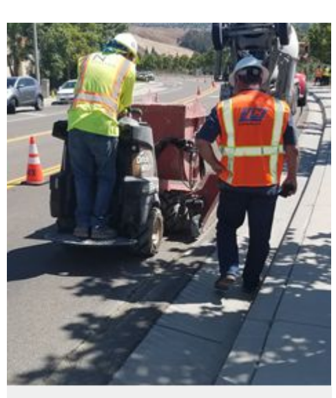
Vacuum unit collects debris. 500-1,000 ft. avg. completion per day.