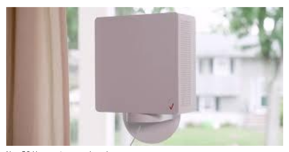
New 5G Home gateway and receiver