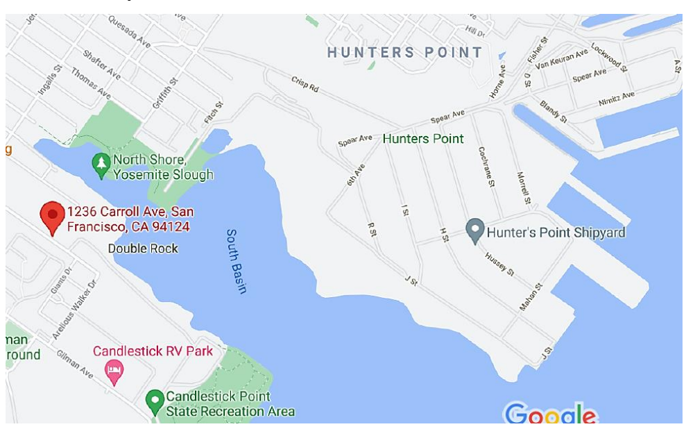
Exhibit 1: Map of 1236 Carroll Avenue