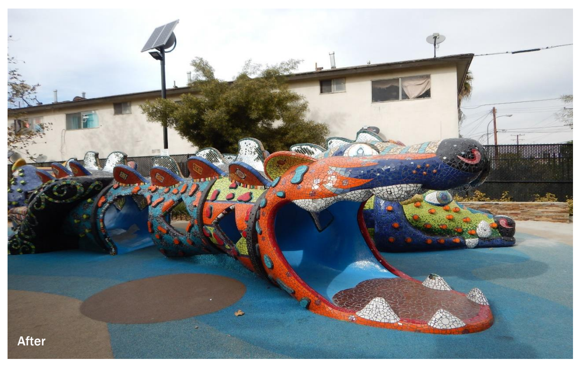
From blighted land to a vibrant park with soccer and play areas. Shown above: Vacant land before, becomes Benito Juarez Park, after.