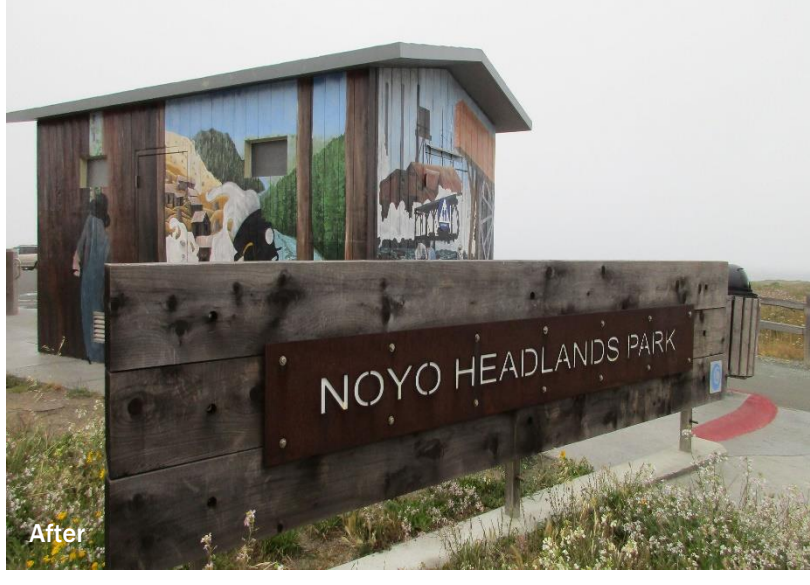
A restroom's exterior is enhanced to tell the community's story. Left: Noyo Headlands Park, before. Right: Noyo Headlands Park, after.