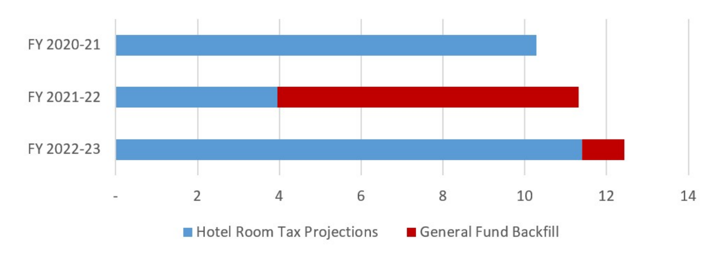
Hotel Room Tax Funding by Source (in Millions)