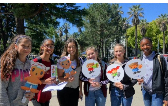
Head Start Educator Training