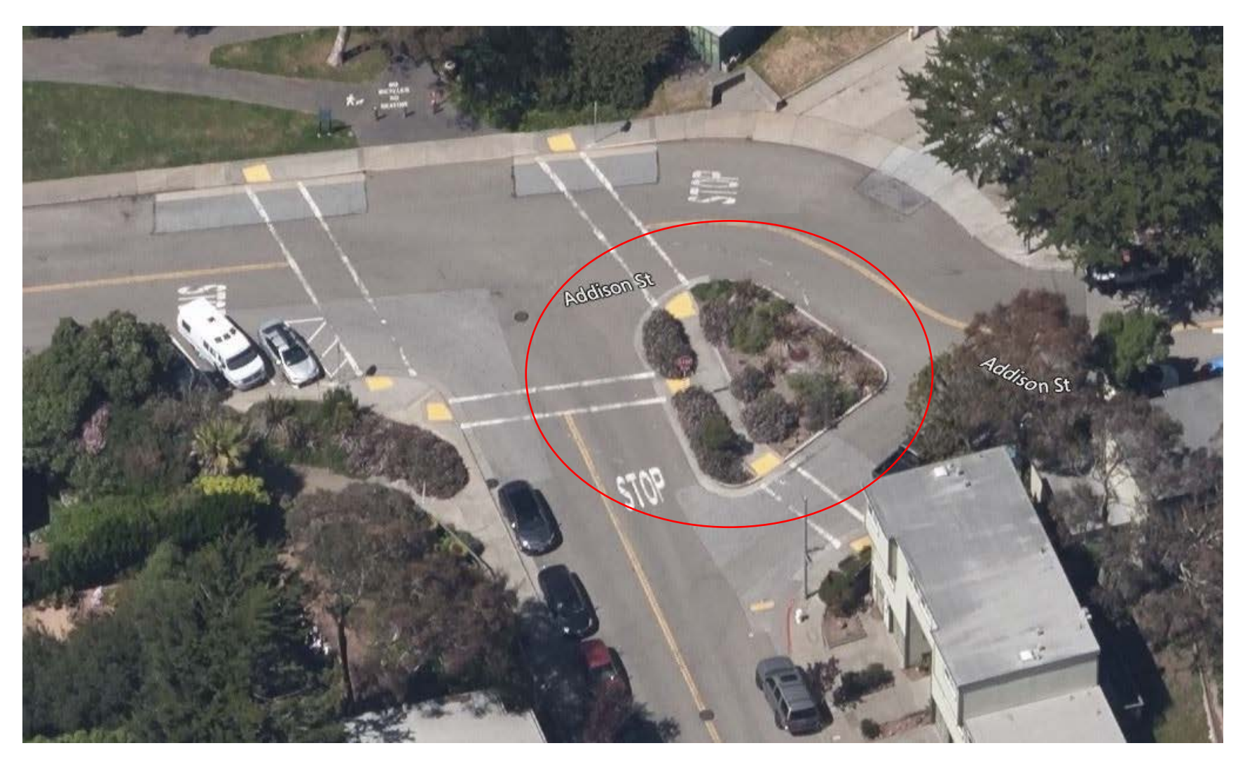
Addison and Digby Streets (Bing Maps)