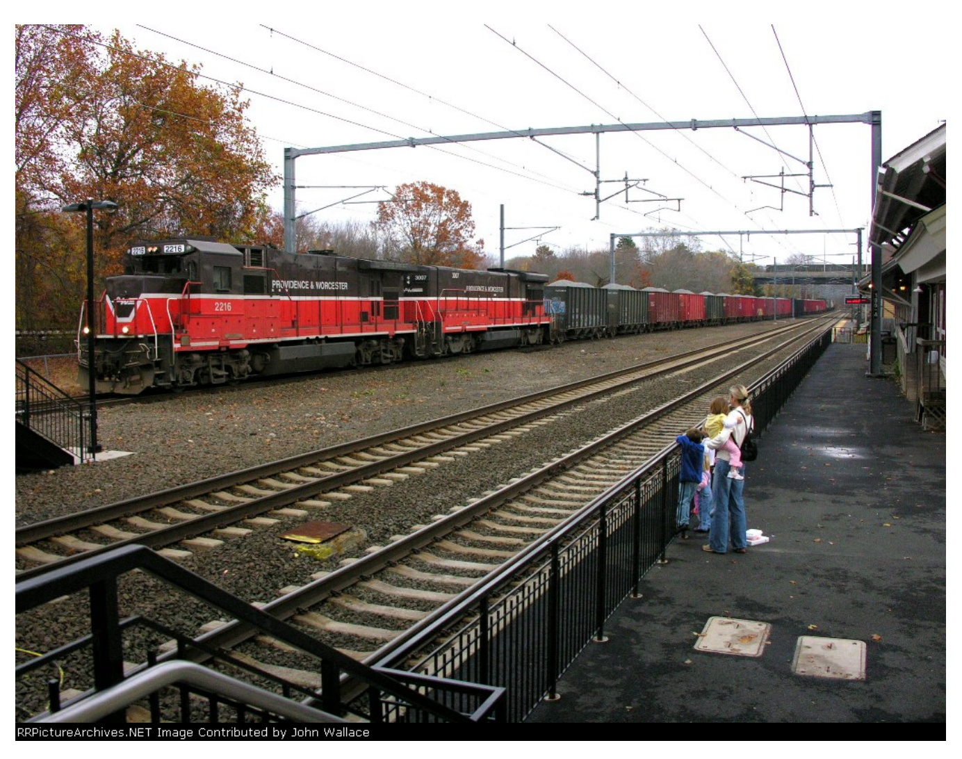
Figure B: Photograph of Providence and Worchester freight railroad operating on shared tracks with electrified 25 kV overhead contact system overhead on the Northeast Corridor