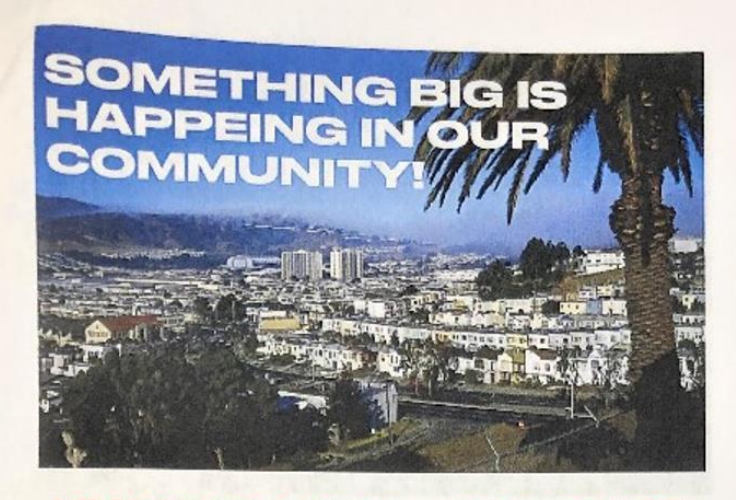
Exhibit 2 – No LOCAL Support