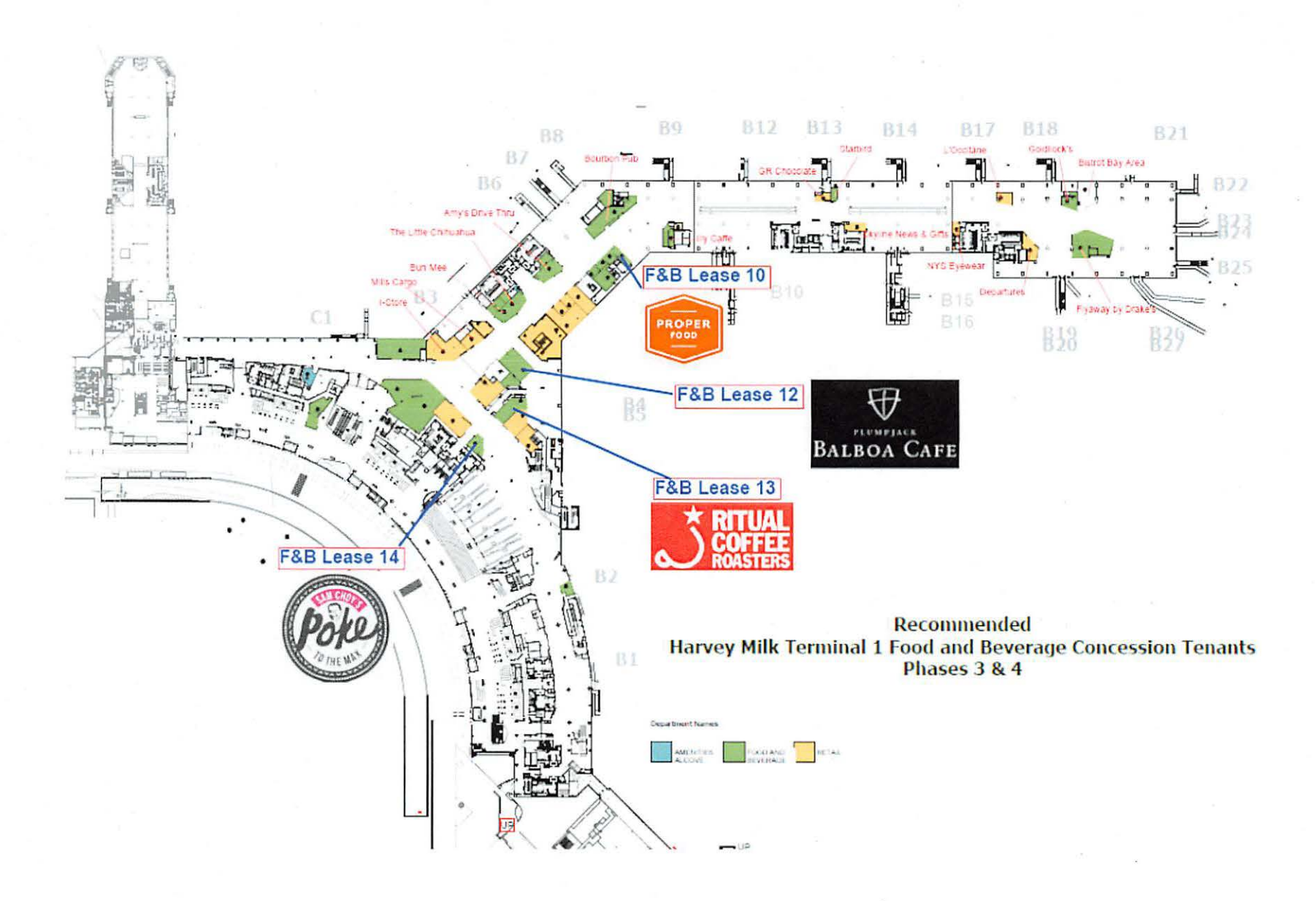
Attachment 1 HARVEY MILK TERMINAL 1 FOOD AND BEVERAGE CONCESSIONS LEASES IN PHASES 3 & 4