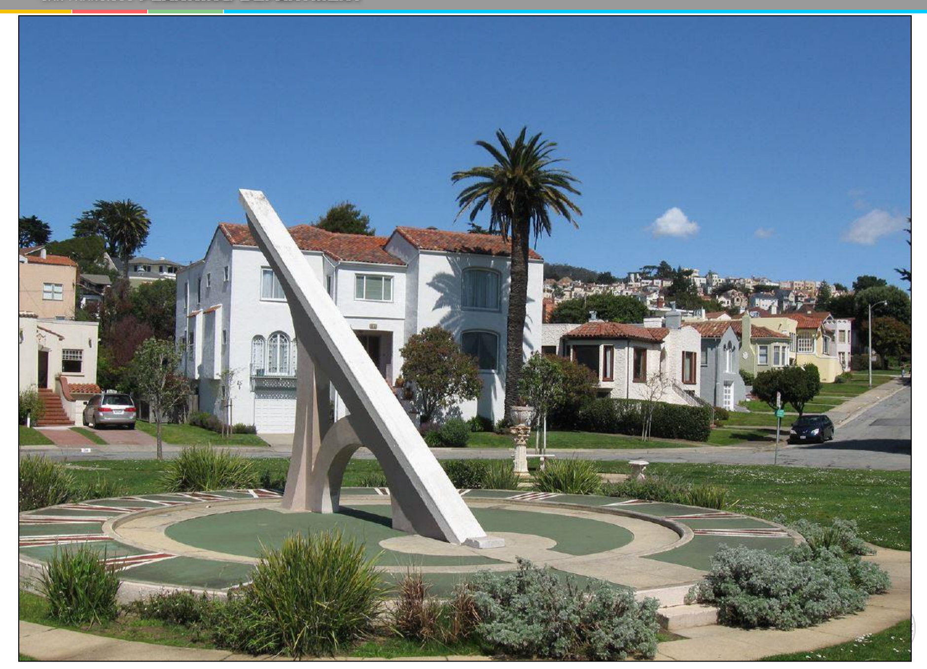
SF Heritage photo included in Board File No. 201299