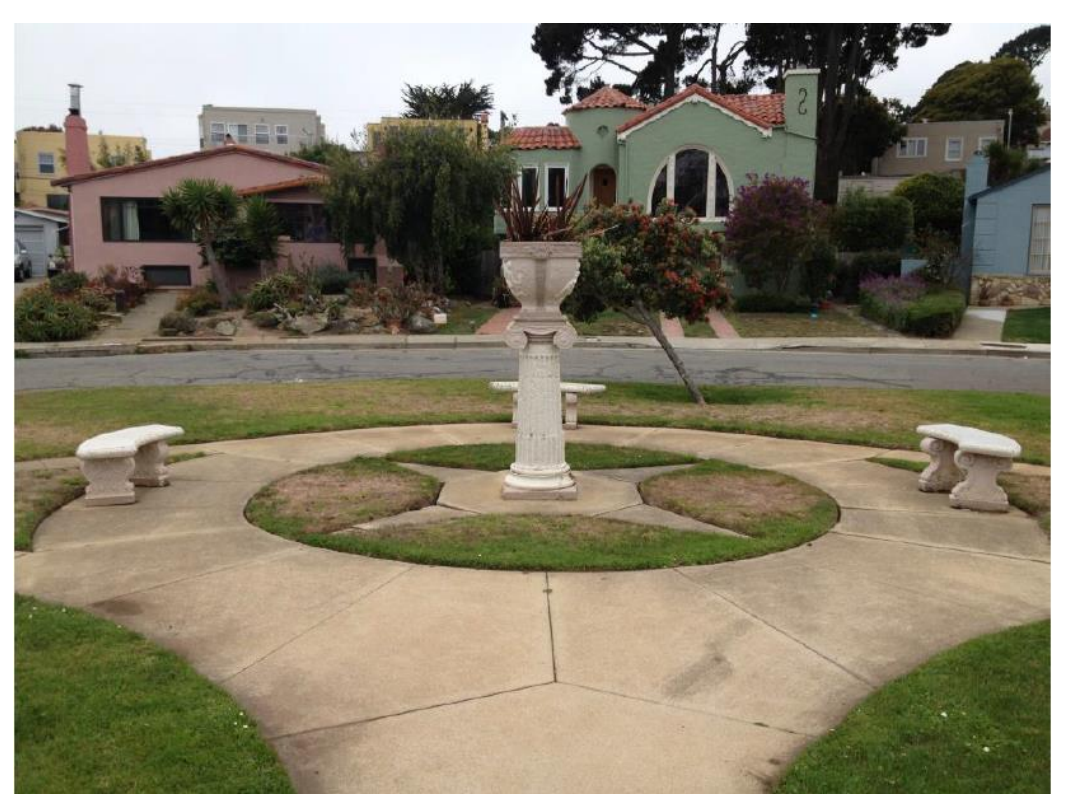
Ionic\ column,\ urn,\ and\ benches,\ top;\ Marble\ dedication\ plaque,\ bottom.\ Ingleside\ Terraces\ Sundial,\ HALS\ CA-99,\ https://www.loc.gov/pictures/item/ca4152/