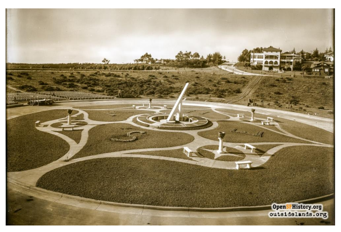
1913, Western Neighborhoods Project – wnp4.17, top; The Mercury News, Jane Tyska/Bay Area News Group, bottom, <a href="https://www.mercurynews.com/wp-content/uploads/2020/02/SJM-L-10COOL-0223-18.jpg?w=1280">https://www.mercurynews.com/wp-content/uploads/2020/02/SJM-L-10COOL-0223-18.jpg?w=1280</a>