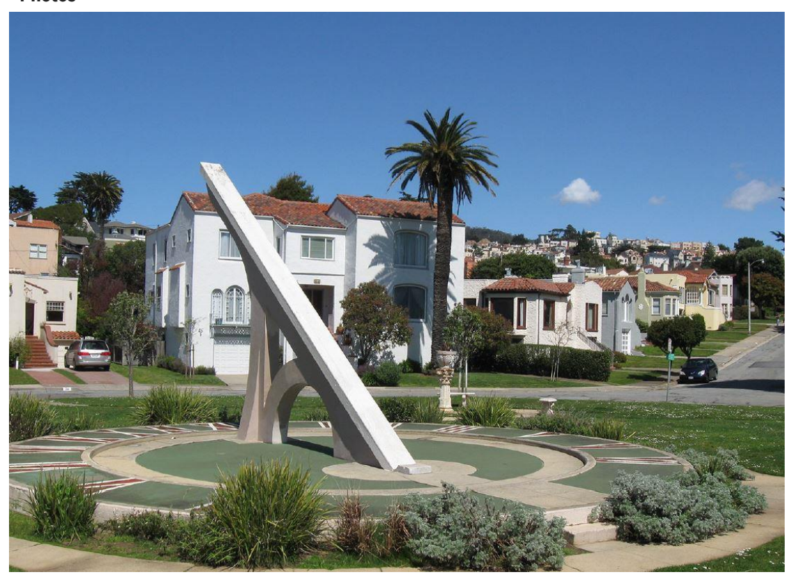
Ingleside Terraces Sundial and Sundial Park, SF Heritage photo included in Board File No. 201299, top; Benches, urns, star-shaped ornamental paving, and walkways, Google, bottom.