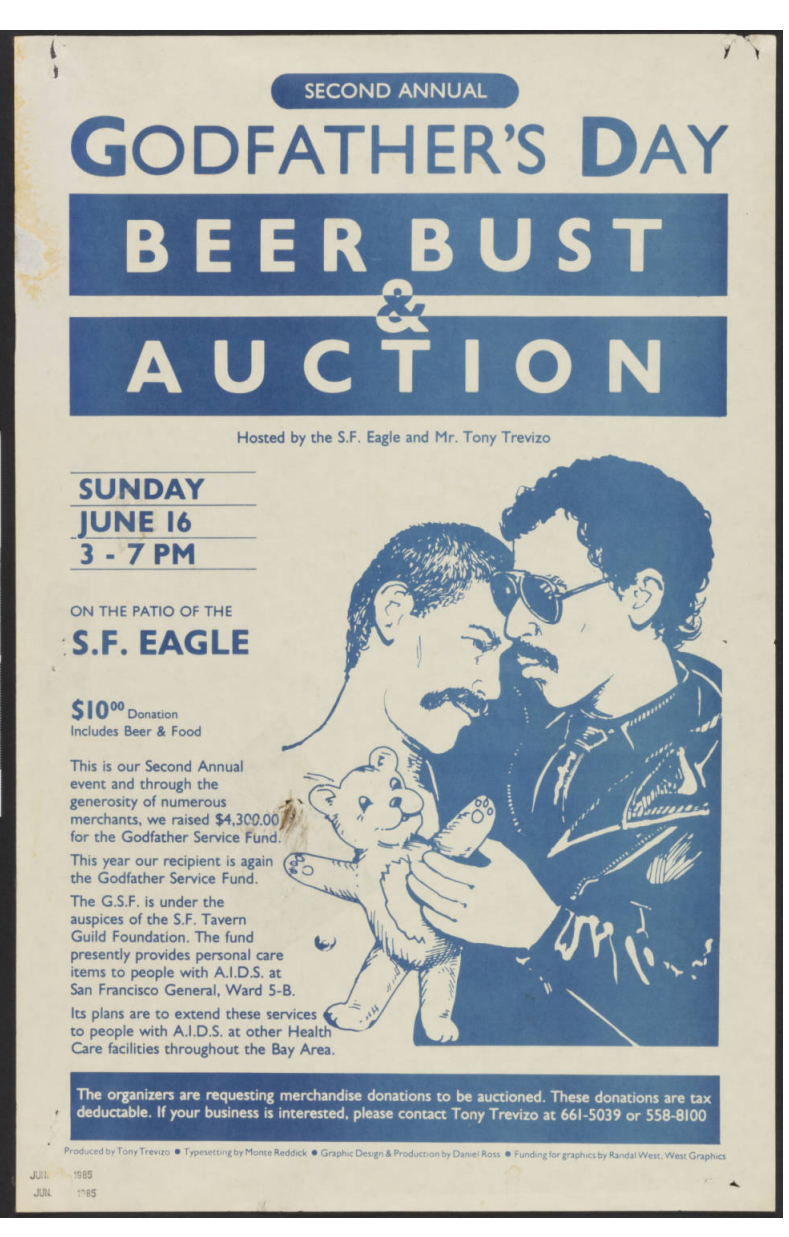
1985 AIDS fundraiser flyer.