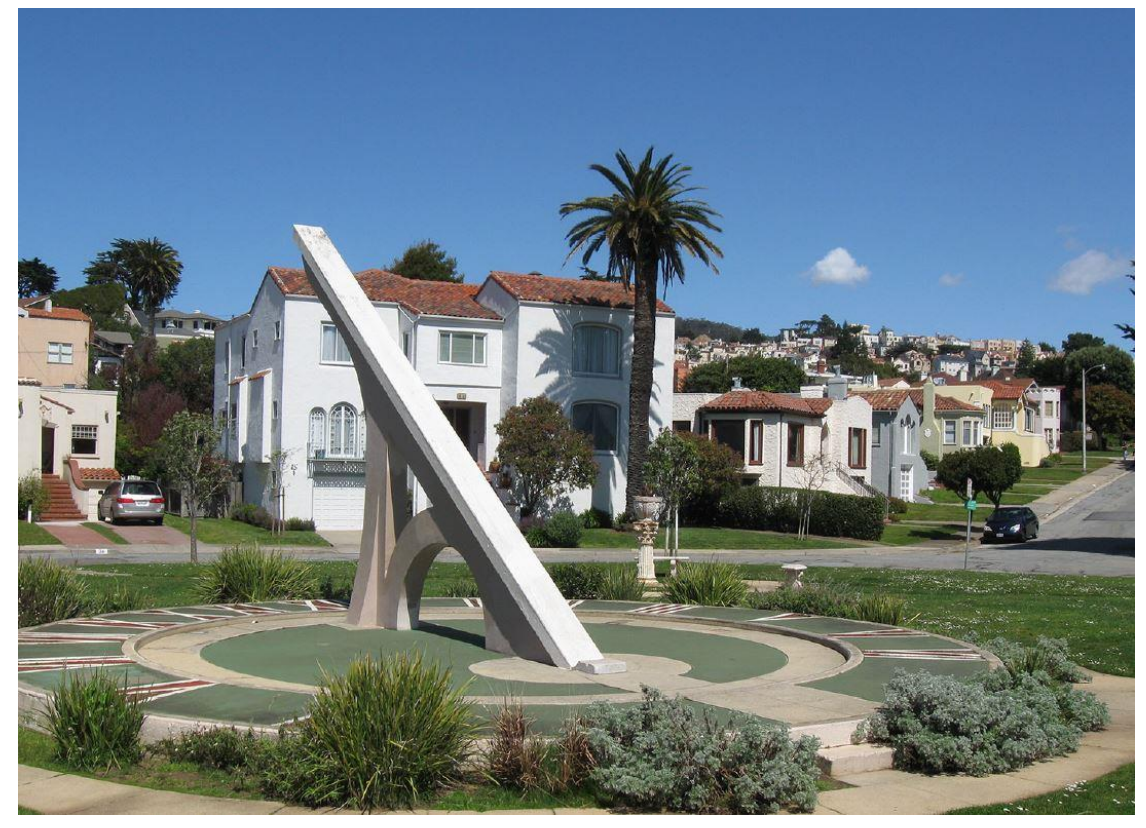
Ingleside Terraces Sundial and Sundial Park, SF Heritage photo included in Board File No. 201299, top; Benches, urns, star-shaped ornamental paving, and walkways, Google, bottom.