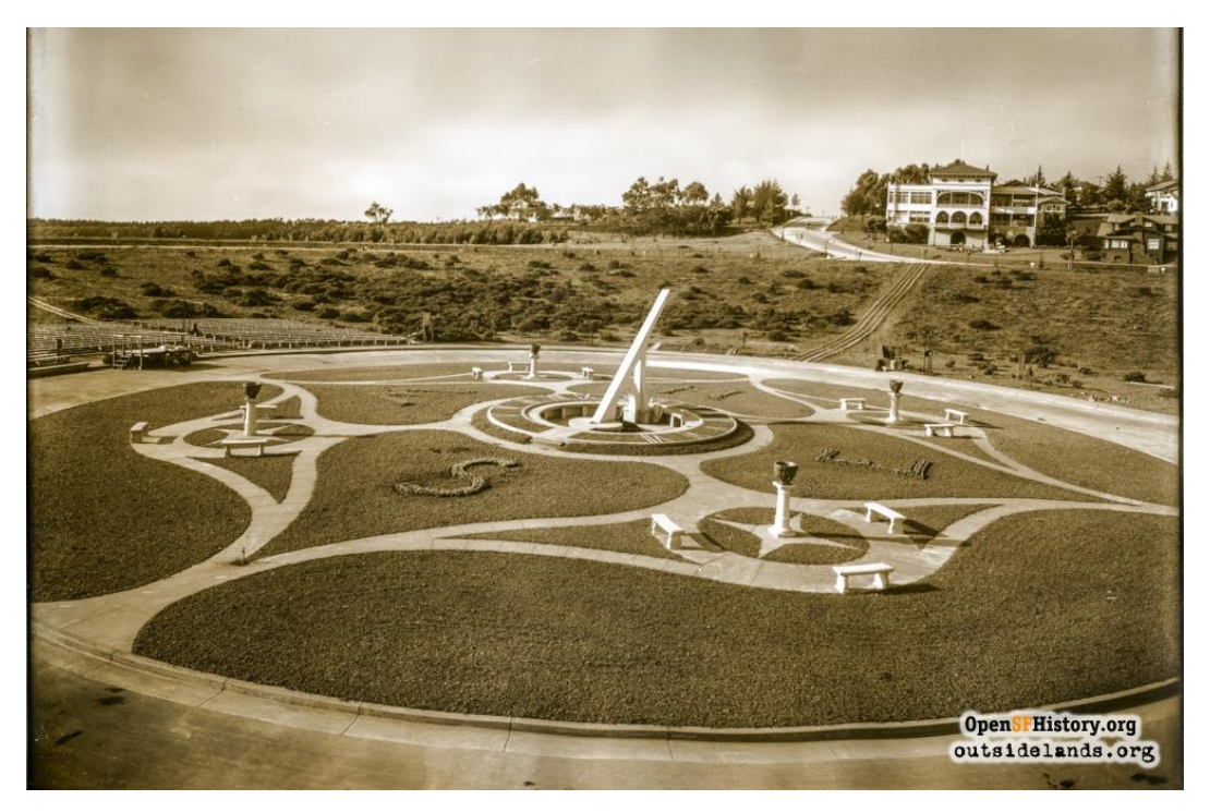
1913, Western Neighborhoods Project – wnp4.17, top; The Mercury News, Jane Tyska/Bay Area News Group, bottom, https://www.mercurynews.com/wp-content/uploads/2020/02/SJM-L-10COOL-0223-18.jpg?w=1280