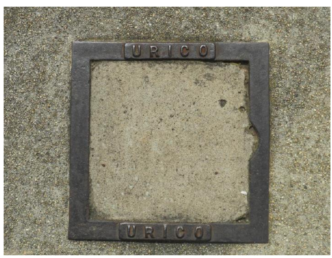
URICO Grate, Ingleside Terraces Sundial, HALS CA-99, https://www.loc.gov/pictures/item/ca4152/