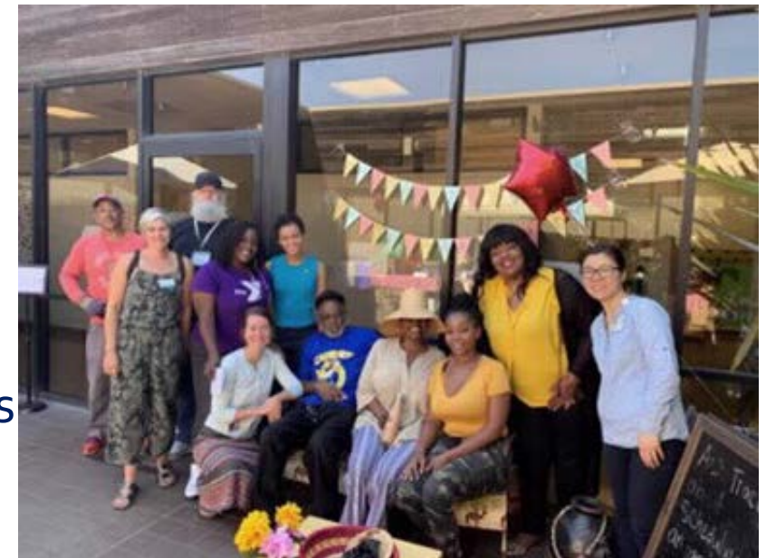
Southeast Health Center's Food Pharmacy 2 Year Anniversary Celebration, 2019