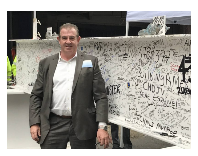
Interim Department of Building Inspection head

There are, in fact, no recorded foundation inspections on this site. None. And the rough framing inspection was conducted by Curran in June, 2013, by which time the building was already five stories. "Rough framing," incidentally, is a building's wooden exoskeleton and endoskeleton. So, unless Curran had X-ray vision, it's unclear how he'd do this inspection in June, 2013, on a largely completed five-story structure, especially on the exterior fire walls, which are flush with the neighboring building.