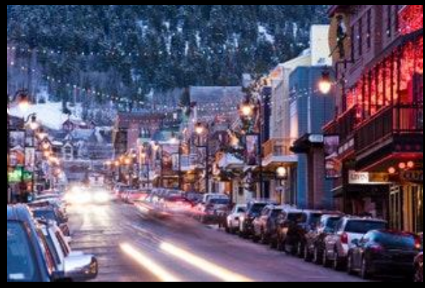
Park City, UT