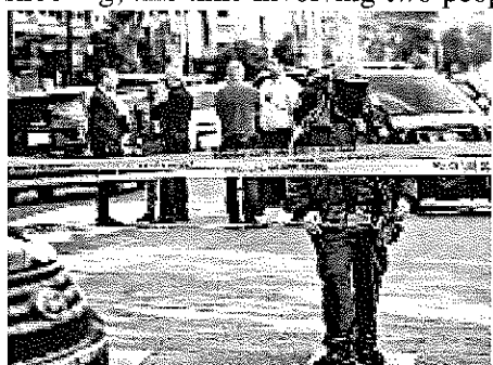
Police cordon off Haight Street.

With helicopters circling the Haight on the afternoon of November 4, neighbors were alerted to news of another shooting, this time involving two people near Haight and