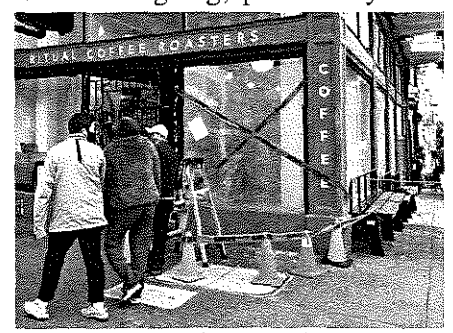
One random shot broke the front window of Ritual Coffee on the corner of Haight and Central. No customers were injured.

Although police cannot divulge details because the case in ongoing, preliminary investigation suggested a